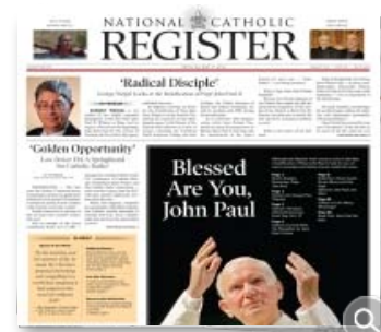
Print Edition: April 24, 2011

NATIONAL CATHOLIC REGISTER America's most complete Catholic news source A Service of EWTN